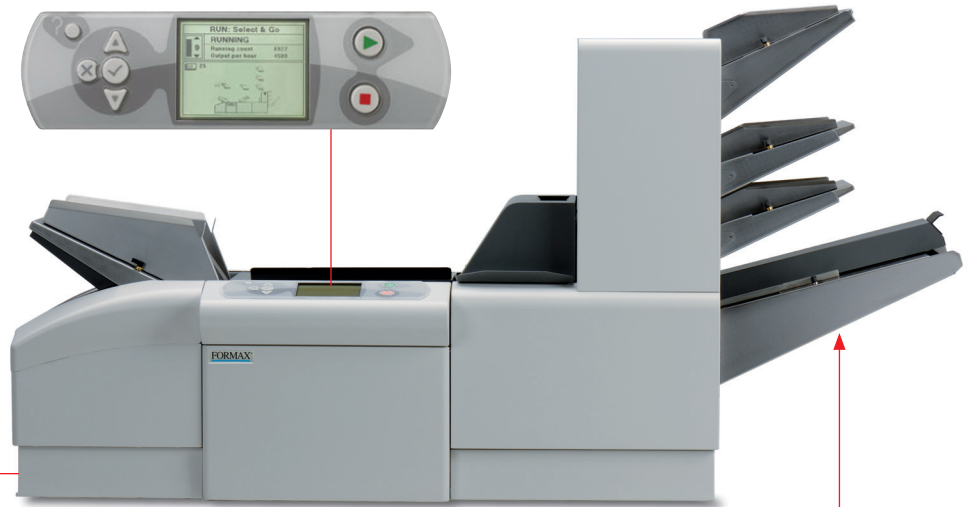
FD 7100-Basic 3 w/ Optional Accumulator