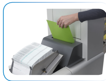
Daily Mail Feeder

* Paper & envelope specifications may vary. All media must be tested.