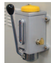
Optional EvenFlow™ reservoir and pump