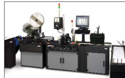
Above, Jet 1 Tabber shown in-line with full Jet 1 system including UltraFeed™ Feeder, Jet 1 Tabber, SIMS (Secap Ink Management System), Postnet Verifier, Printer Base, Dryer, Conveyor.