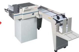
TC48 Conveyor shown with the 30K Ink Jet Address and Envelope Imager ▶

◀ Conveyor is dryer-assist ready with built-in interface allowing easy mounting for the optional TD36 Dryer