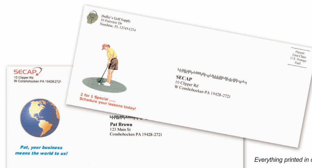
Everything printed in one pass.

Personalizing and using color on your outgoing mail just got faster and easier. With the SA3150, you can do both, making a good thing even better. Print in brilliant full color for eye-catching appeal that gets attention and makes your piece stand out in a heap of mail! Use color in your logo and graphics. Personalize using your customer's name for greater impact and effectiveness. Best of all, do all this in one pass for maximum productivity!