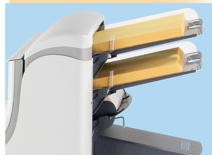
2 sheet feeders and 1 insert/BRE feeder