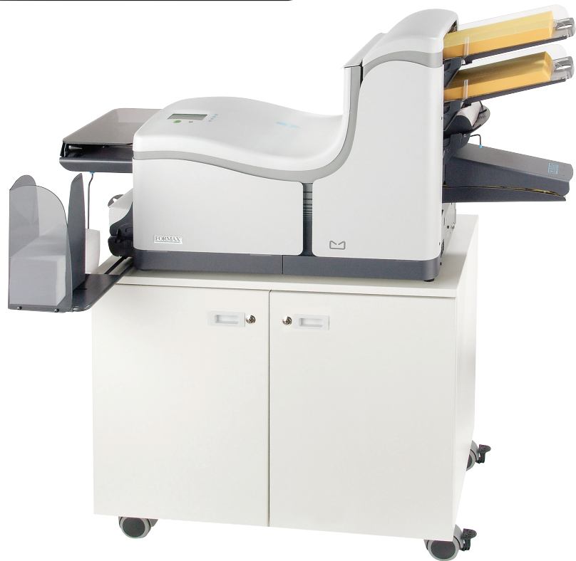
FD 6202-Advanced 2, shown with optional side exit tray and cabinet

MILLENNIUM MAILING EQUIPMENT 84 Harris St Pawtucket, RI 02861-1719 Tel. 401.729.1131 www.millennium-mailing.com