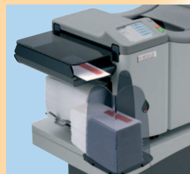
Optional Side Exit Tray