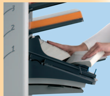
Optional Production Feeder holds 325 BREs or 1,200 sheets