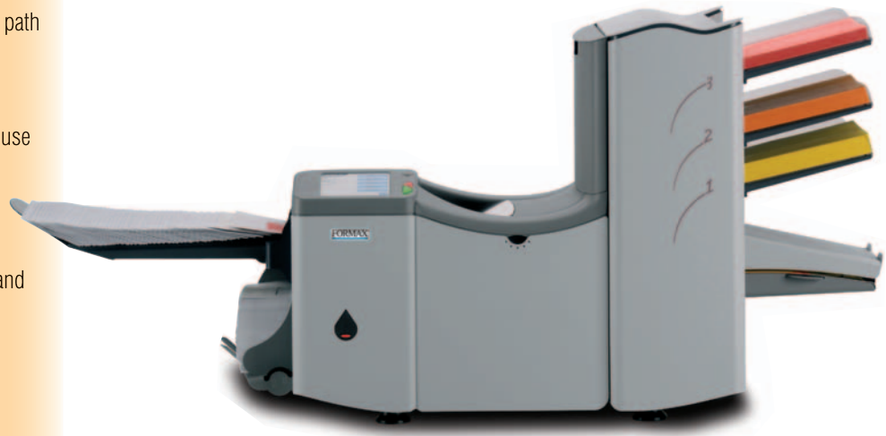
Shown with optional conveyor