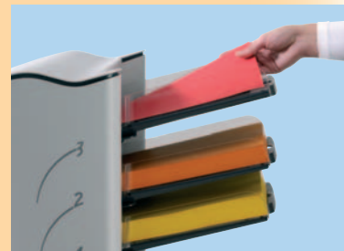
Horizontal feeders offer a loading capacity of up to 325 sheets each