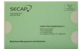
Shown: Sample booklet with toe and heel tab placement using 1½" tabs.