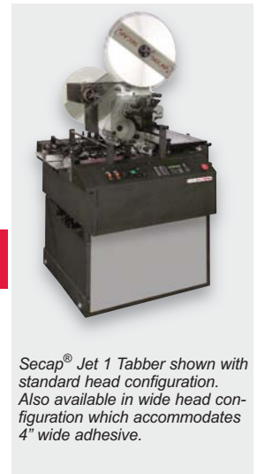
Secap® Jet 1 Tabber shown with standard head configuration. Also available in wide head configuration which accommodates 4" wide adhesive.