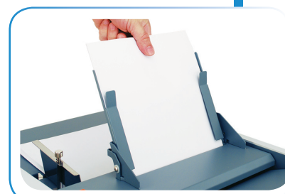
Optional Multi-Sheet Feeder