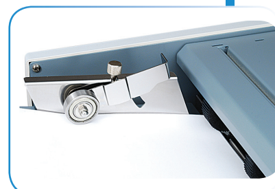
Cross Fold Guide