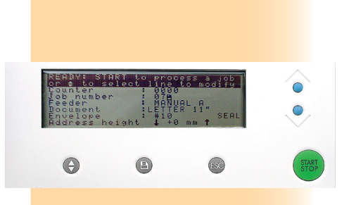
User friendly control panel