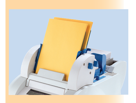
2 sheet feeders and 1 insert/BRE feeder