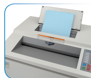
AutoFeeder holds up to 175 sheets. Load, press start and walk away!

Formax - New Hampshire, USA www.formax.com