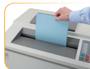
Standard Hopper for hand feeding up to 18 sheets at once