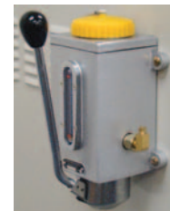
Optional EvenFlow™ reservoir and pump