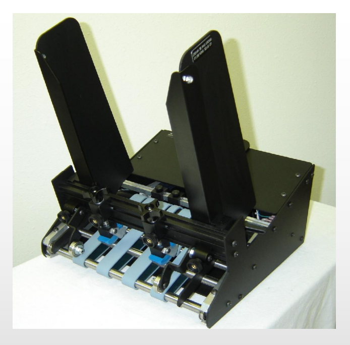
Straight Shooter Model C-12 Patents Pending