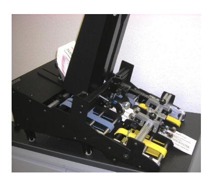
Acceleration table down Great for collators or inserters Handles rigid materials better!

Just like our feeders, our acceleration table features repositionable belts, complete paper guides, easy belt changes, and total product control. In addition, the angle of the acceleration table is adjustable! This makes it the ideal feeder for a wide variety of applications.